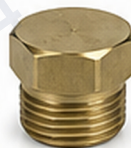
TEST PLUG (Brass)