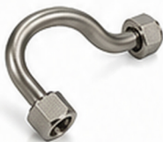
SIPHON (Steel & Stainless Steel)