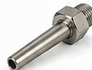
THERMOWELL (Stainless Steel & Brass)