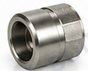
WELDING SOCKET (Steel & Stainless Steel)